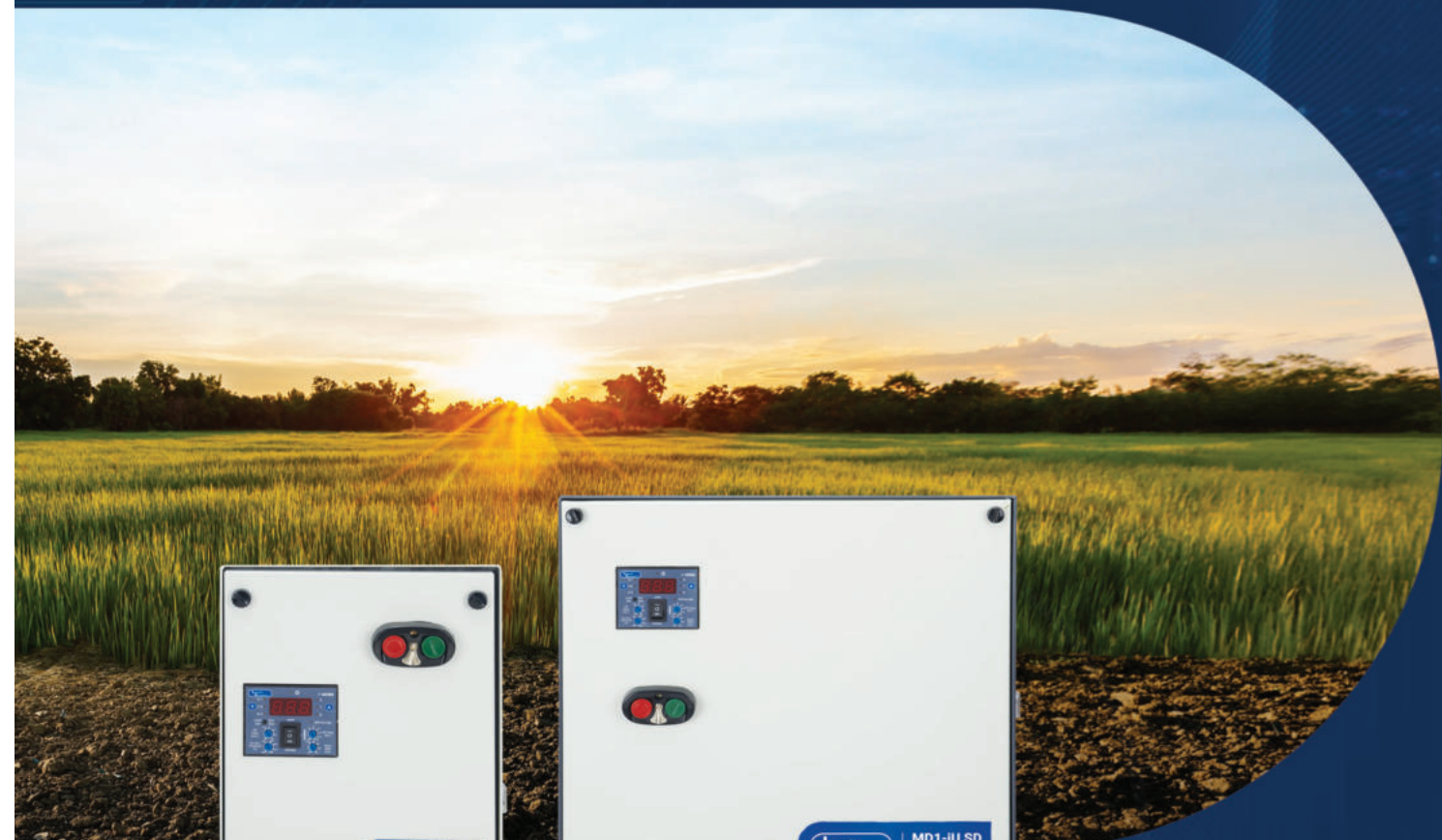
MD Starter+ DOL